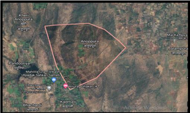
Figure:1 and 2 reported Individual and Satellite image of study area