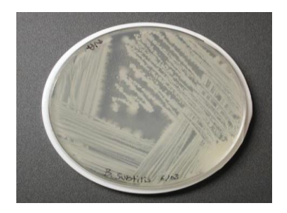
Figure 4.1 Bacillus subtilis in Nutrient Agar Plate

Bacillus subtilis, known also as the hay bacillus or grass bacillus, is a Gram-positive, catalase-positive bacterium. A member of the genusBacillus, B. subtilis is rod-shaped, and has the ability to form a tough, protective endospore, allowing the organism to tolerate extreme environmental conditions. Unlike several other well-known species, B. subtilis has historically been classified as an obligate aerobe, though recent research has demonstrated that this is not strictly correct.