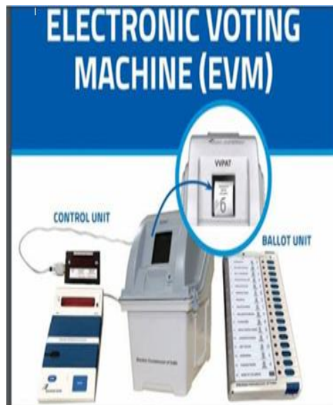
Figure 2: Present voting system

They are utilized relationship based unique mark coordinating method to upgrade the exhibition and to ask a lot of dependable unique mark acknowledgment. Anil k. jain and et.al.[6] have a given brief portrayal about biometric inside the book "Handbook of biometric". Sanjay Kumar and et. al.[7] built up a structure for the electronic appointive system supported unique mark biometric and their goal of this method is wiping out sham democratic and vote reiteration. Following are the issues of Present Voting System