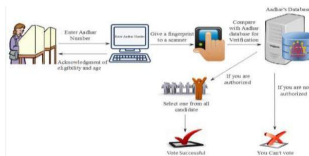
Figure 3: shows the engineering of Aadhar based Election appointive framework [8][9].