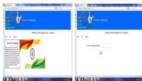
Fig 4.1: Voting system page(a)

This proposed system has been actualized in ASP.NET with SQL. The main page of our work is Home page (as appeared in fig 4.1) and in this way the framework takes Aadhar number in the wake of clicking "Vote" tab, it checks aadhar number and (age ought to be over 18 years, fig 4.2). After confirmation framework shows voter's data like, Aadhar number, Name, Address and Date of birth, that are as of now put away in Aadhar's database and framework welcome voter's unique mark (as appeared in fig 4.3 and fig 4.4). In the event that unique mark picture is coordinated with layout picture which is put away in Aadhar's database then next page shows applicant's rundown with their political race party image for choice of an up-and-comer (as appeared in fig 4.5 and fig 4.6). Subsequent to choosing a competitor, the framework requests vote affirmation. At long last, the framework shows result "Vote effectively" (as appeared in fig 4.7 and fig 4.8) [11].