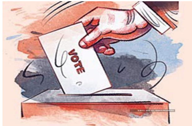
Figure 1: Old voting method

In the old arrangement of casting a ballot, votes are thrown by voting form paper.