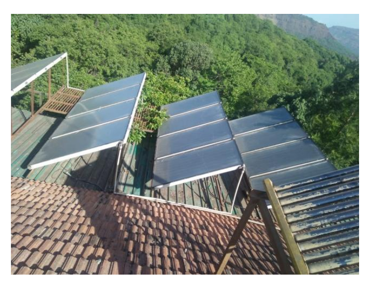
Figure 3. Photovoltaic (Solar) Cells

India is endowed with abundant renewable energy resources, like biomass, wind, small and large scale hydro with potential for hydrogen fuel, geothermal and ocean energies. Except for the large scale hydropower generating station which serves as a major source of electricity, the current state of exploitation and utilization of renewable energy resources in the country is very low. The main constraint in the rapid development and diffusion of technology for the exploitation and utilization of renewable energy resources in the country is the absence of appropriate policy, regulatory and institutional framework to stimulate demand and attract investors. The comparative low quality of the systems developed and the high initial upfront also constitute barriers to the development of these systems.