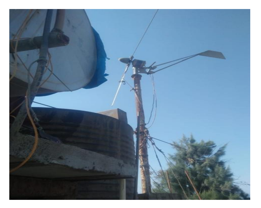
Figure 4.Wind Turbine Energy

A small wind electric system will work for you if: