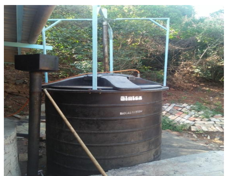
Figure1. Bio Gas Plant at SanviPune