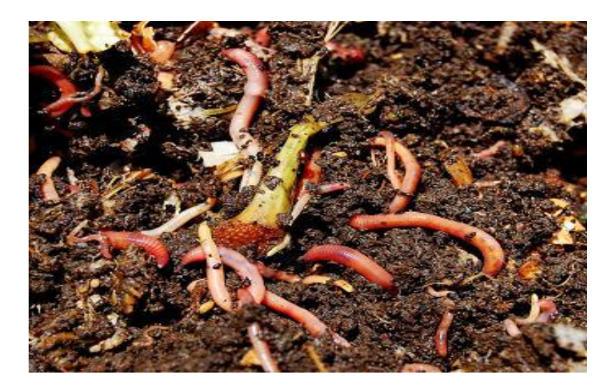
Figure 2: Vermi Composting