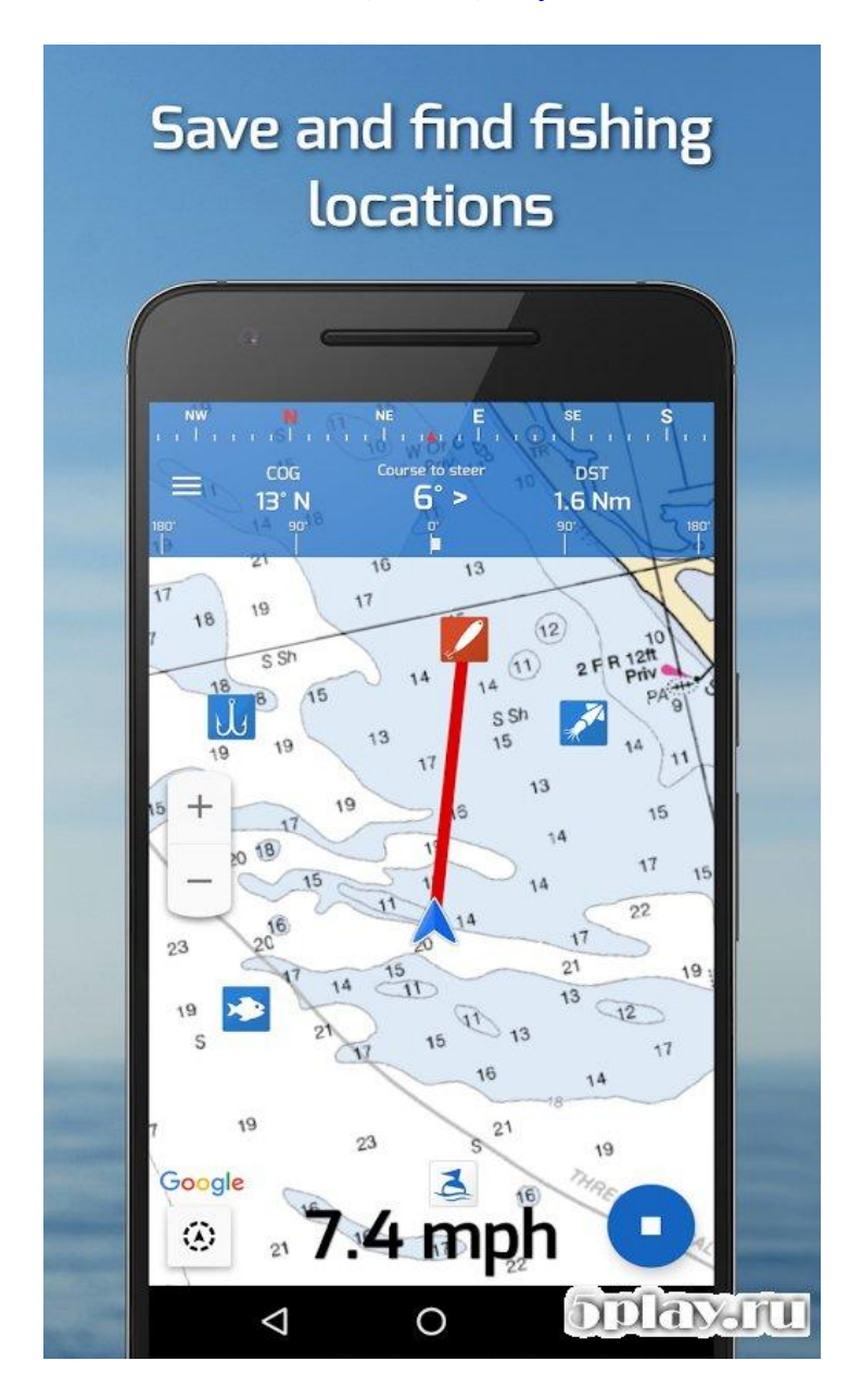
Figure 3: GPS tracker

Few advantages of the system includes that the android mobile phone is affordable to all. It costs less when compared to kit. Ease of use even by illiterate people and no overhead of device maintenance.