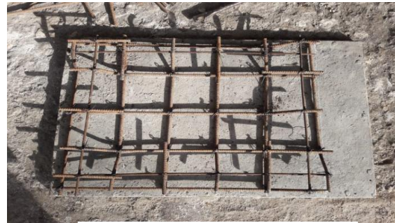
Fig.2 steel reinforcement