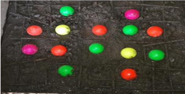
Fig.1 Placing of plastic ball in reinforcement

The size of steel bar vertical direction is 62cm and in the horizontal direction is 24 cm and the spacing between is 6.5cm and the diameter of bar is 10mm.and the diameter of HDPE ball is 6.5cm.the combination of bar and ball are show in fig. are given below.