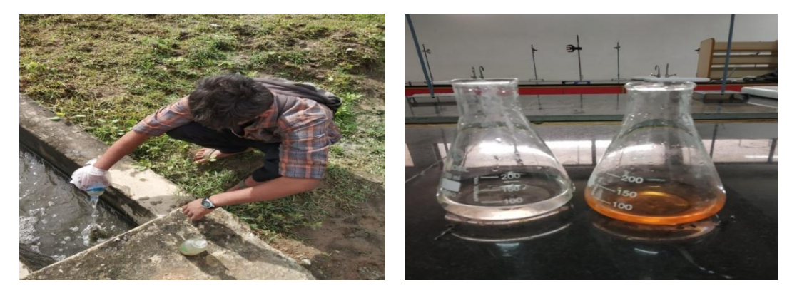
Figure 4:-waste water collecting