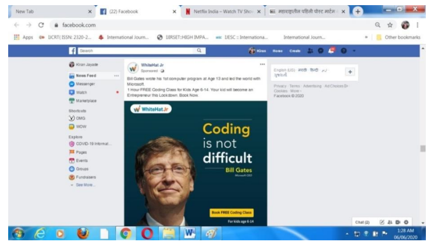
Fig.1. Facebook timeline

Facebook users are over 2.498 billion monthly active users worldwide in the month of April 2020, Facebook is the biggest social network worldwide. In the third quarter of 2012, the number of active Facebook users surpassed one billion, making it the first social network ever to do so. Active users are those which have logged in to Facebook during the last 30 days. During the last reported quarter, the company stated that almost 3 billion people were using at least one of the company's core products (Facebook, WhatsApp, Instagram, or Messenger) each month.