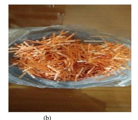
Fig. 1 (a) Shows the waste plastic bag and (b) strips.