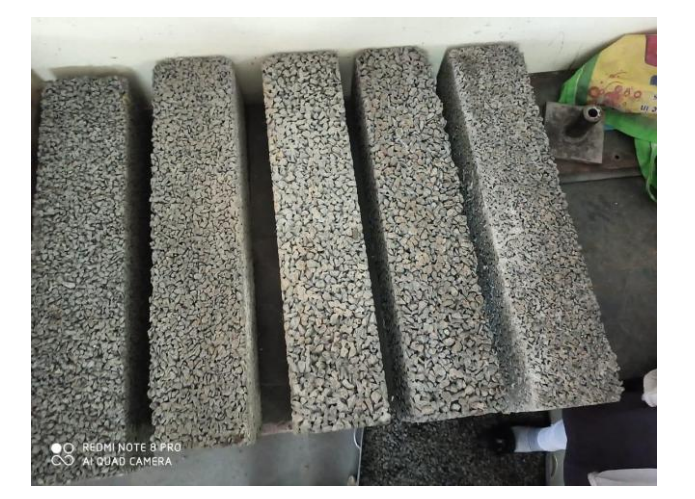
Fig. Actual Work of Project