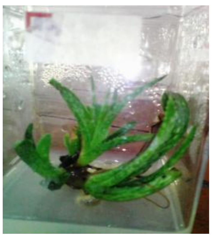
Figure 2: Showing multiple shooting and rooting in MS media