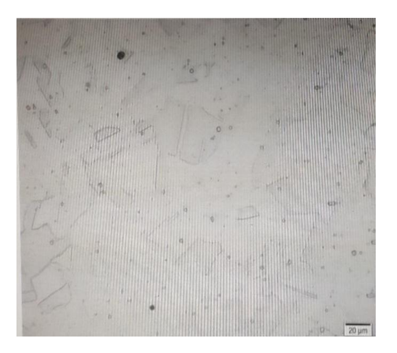
Fig.1 microstructure of 304 stainless steel

The results for the microstructure of weld metal stainless steel 202 represents a Delta ferrite structure in matrix of austenite in weld metal.