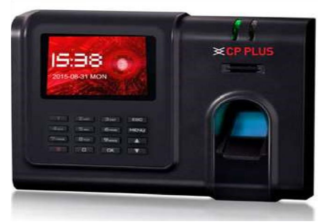
Fig. 1. Hardware based biometric attendance (existing) system

Recording safe Teacher's or representative's attendence isn't a simple errand, in view of approval and constrained access to equipment gadgets one after another. In most instructive organizations, investment of Teacher's in participation process is viewed as a dynamic procedure for permitting information move. This shows the significance of having Teacher's to go to the booked talks and Task. Regular strategies for checking Teacher's participation are as yet embraced by most universities. One basic technique is by having Teacher's to physically sign the participation sheet