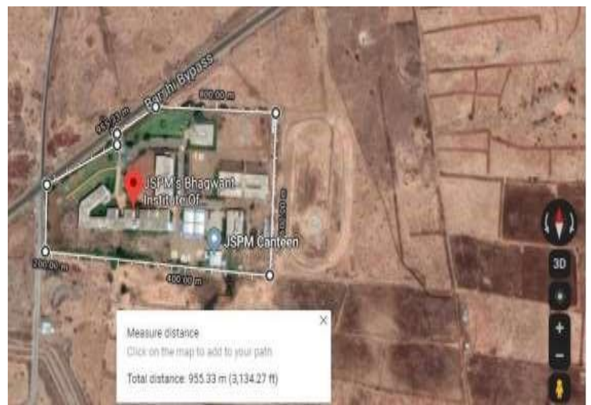
Fig.2. the Geofenced Area of BIT college, Barshi

Geo-fencing is a virtual boundary that utilized the worldwide situating framework (GPS) or radio recurrence recognizable proof (RFID) to characterize geological limits. Its capacity permits an application to trigger when a gadget crosses a Geo-fence and enters (or leaves) the limits characterized. Some application characterizes limits by longitude and scope or through client made and Web-based maps.