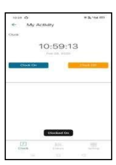
Fig.1.4.Clock-In Clock-Out Button on page