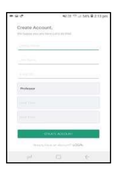
Fig.4. Login and Sign-up page for user and admin