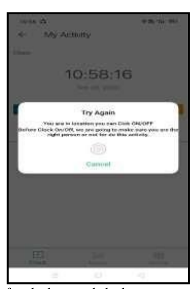
Fig.5. fingerprint authentication for clock-on and clock-out