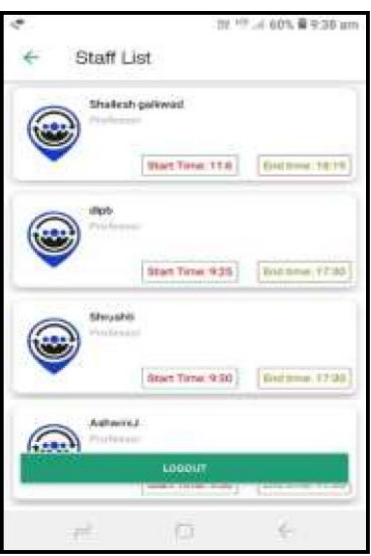
Fig.6. Entries on employee side and Admin side