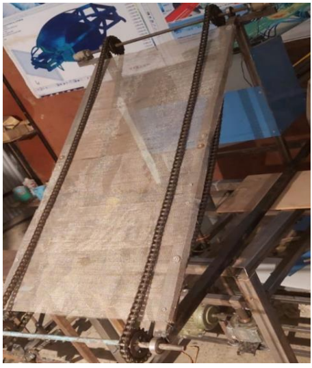
Fig. 4. River CleaningMachine