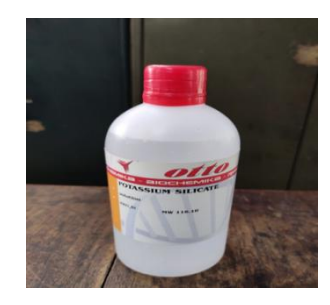
Fig.4. Potassium silicate solution

6. Potassium silicate: It is a source of highly soluble Potassium and Silicon and it is manufactured by Calcinations process that combines Silica sand (SiO2) and Potassium Carbonate (k2CO3) at 1100-2300oF for upto 15 minutes. Then the two materials fuse into glass, which can be dissolved with high pressure steam to form a slightly viscous liquid or cooled, with clear and ground into a powder form. CO2 is evolved on it. Then the solution can be dried to form hydrous powder crystals of potassium silicate. These are manufactured as solids or thick liquids, depending on proposed use having a density from 1.6g/cubic cm to about 1.4g/cubic cm. For instance, water glass functions as a sealant in metal components. Finally, even though potassium silicate manufacture is a mature industry, there is current research for new applications given its heat conductive properties.