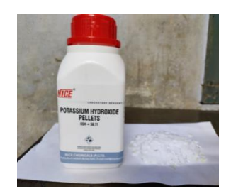
Fig. 3. Potassium hydroxide pellets

It also used in many industries as a strong chemical base in the manufacture of pulp and paper, textile, drinking water, soap and detergents and as a drain cleaner. Production in 2004 was approximately 60 million tonnes, while demand was 51 million tonnes.