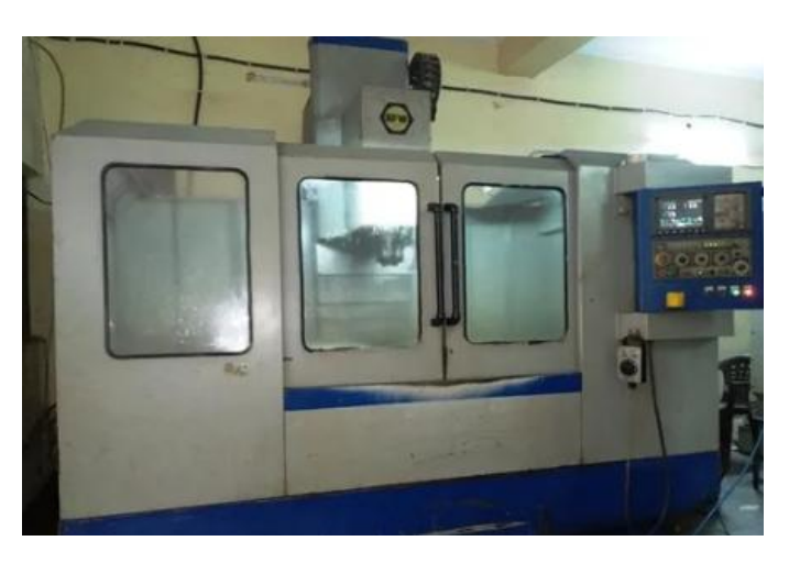
Fig. 2 .VMC machine

Taguchi's design of experiments is a robust experimental design technique which helps in reducing the total number of experiments to be carried out using the orthogonal array to find out the most optimum level of each performance parameter . Taguchi's orthogonal arrays are widely used to investigate the effect of input process parameters on the process responses.