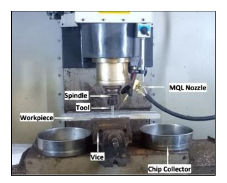
Fig. 1. VMC Setup.

The oil is equipped in tiny quantities through a pipe to the nozzle tip wherever the air, flowing from a distinct pipe, can force the oil to the cutting zone. the appliance of the MQL technique may be found in an exceedingly type of machining processes, particularly in primary processes like turning, drilling, milling, and grinding. additionally, cutting of wide sorts of work piece material, like metallic element, steel, hardened material likewise as hard-to-cut material may be done mistreatment the MQL technique.