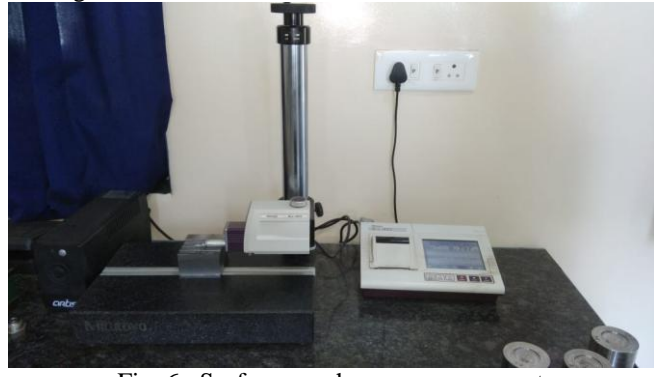
Fig. 6 Surface roughness measurement

The milled surface roughness for each experimental combination was measured with a roughness tester (SJ-410 Mitutoyo ). The measurement was taken in the feed direction and width of cut direction. An example of surface roughness measuring is shown in Figure