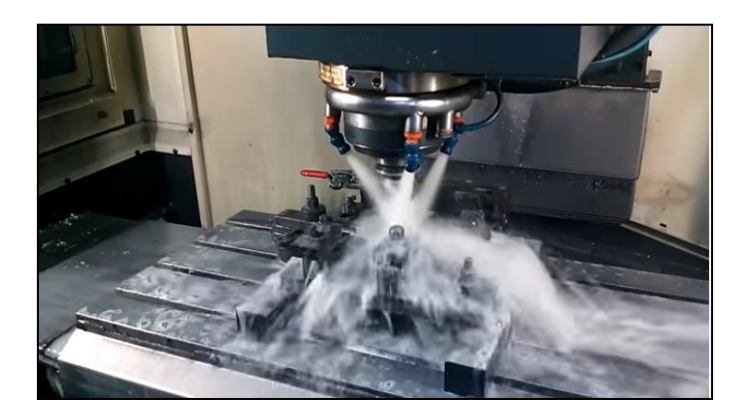
Fig. 5 Taguchi Specimen For MQL

From 1st trial it conclude that surface roughness value of aluminum 6061-T6 specimen during MQL was better than flooded coolant.