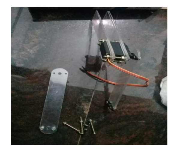
Fig.1. & Fig.2 Base, Fig.3, Fig.4 & Fig.5. Link-1 and Link-2, Fig.6. Links