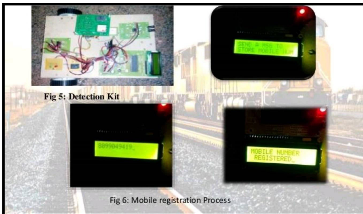
(b) DETECTION KIT & MOBILE REGISTRATION PROCESS