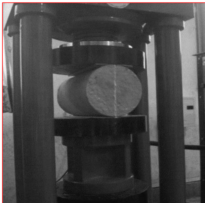
Fig. Tensile Strength Machine