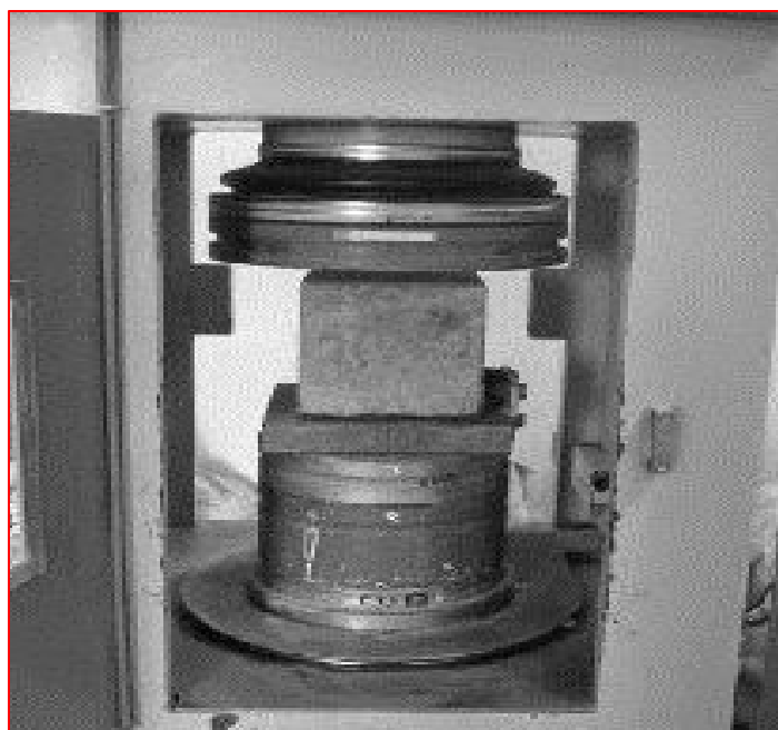
Fig. Compressive Strength Machine

Outdoor cured specimens of cubes were subjected to a 28-day compressive strength test. The cube specimens will be tested in a 3000KN compression measuring unit. Until testing, the bearing surface of the cubing machine and the surface of the cubes should be wiped clean. The loading faces should be parallel to the loading wall, and the cube specimen should be 150mm x 150mm x 150mm, with the axis of specimen carefully aligned at the loading frame's middle. The load applied will be gradually increased, and if the specimen or load applied fails, the failure should be registered. Compressive strength = load/area N/mm 2 is the formula for calculating concrete's compressive strength.