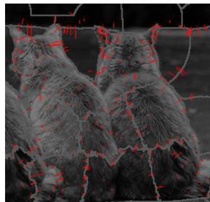
ii – Image with the tampered areas highlighted

Image Forgery Detection The image forgery detection system was proposed in the smart healthcare framework. The system was tested using three different databases, two having natural images and one having mammograms. The system achieved accuracies over 98 percent for natural images and 84.3 percent for medical images. The system performed best when we combined the scores of two classifiers. The area of medical image forgery detection needs more attention to gain the trust of patients and to avoid their embarrassment. There is still a long way to go in this research. The next generation of network technologies bring immense computing power and ubiquitous service. We can take advantage of these technologies to make the healthcare system seamless, real-time, trustable, secure, and easy to use.