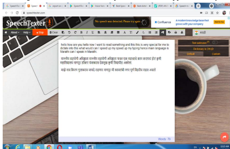
Fig.3: SpeechTexter in English and Marathi language

SpeechTexter app is popular app for speech recognition and conversion of speech to text. Its app size is very small 3.6 Mb and updated latest version 1.4.8 recently on dated 27-04-2021. Its installs are more than 1 million from google play store. It requires the operating system Android 6.0 and above to use on the smartphones. It is a speech recognition and conversion solution with multi-language speech recognizer, documents & emails transcriber, and more. Its website is Speechtester.com . Best for SpeechTexter is the leading online speech to text converter used by thousands of businesses, teachers, lawyers, writers, students around the world. It has the facility of many Indian languages.