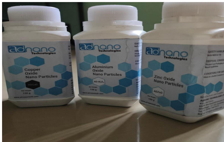
Fig.2 Picture of Nanoparticles

The volume concentrations for nanofluids are fixed as 0.5% for selected nanofluids. The 400 ml of nanofluids is mixed with water stored in solar still. The nanofluids are Al 2 O 3 , CuO, ZnO, and TiO 2 . Hybrid nanofluids are used as ratio of 50:50. The hybrid nanofluids used in this experiment are Al 2 O 3 + TiO 2 , CuO+ZnO.