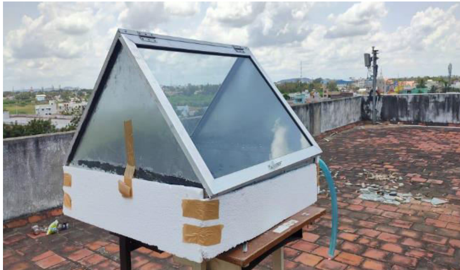
Fig.1 Photographic view of double slope solar still

The performance of Double slope solar still is to be analysed by three stages. I) without nanofluids, II) with nanofluids. The Experiment conducted from morning 6:00 am to evening 6:00 pm in the month of March. The double slope solar still is fabricated and total dimensions of the still were 0.8m \times 0.8m \times 0.1 m . The inclination of the glass cover can be fixed with 30^\circ . The basin still also consists of a flat absorber plate made up of 3mm thick mild steel plate, 3mm glass cover, condensate channel, with thermocol insulation.