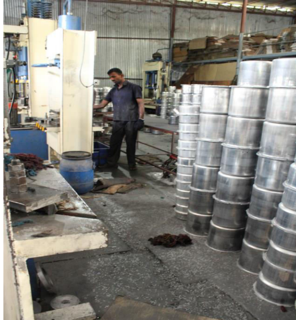
Fig-9: Kanban route card