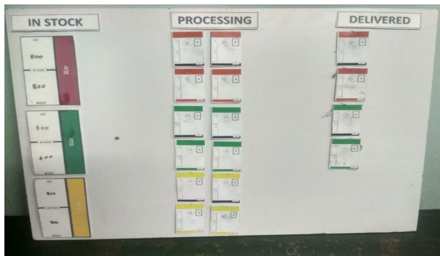
Fig-10: Kanban board