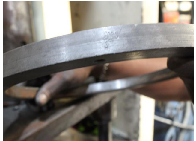
Fig-6:Position mark on die