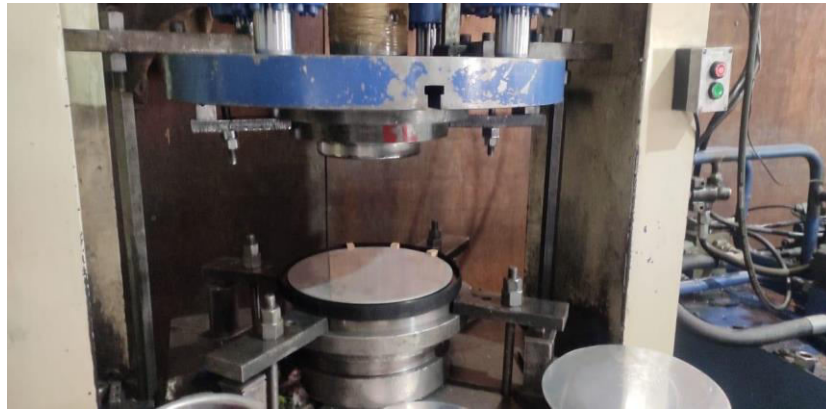
Fig-3:Deep drawing press with adjustable poka yoke fixture

Productivity increase: 60,000 products per annum*Profit : 3.54 lacs + Revenue on increased products (per annum)