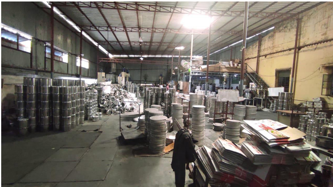
Fig -1: Apple Cookware Manufacturing Company

Apple cookware manufacturing facility is situated in SIDCO Industrial Estate, Pettai, Tirunelveli, Tamil Nadu 627010. Apple cookware is an Indian medium scale production industry who put their hands on both inland sales and export by producing pressure cookers of about 2,00,000 units per annum on their brand and other leading brand name