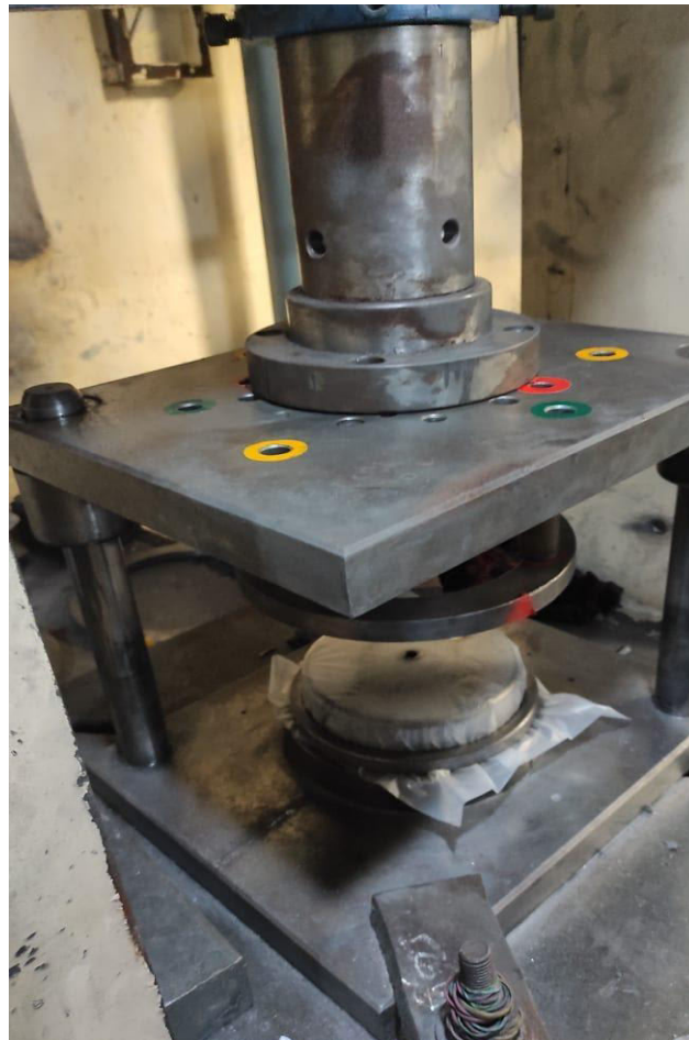
Fig-7:Coining press after implementation

Before the setting up the die would take the time duration of 25 to 30 minutes. In a day the duration taken for setting die is about 80 to 100 minutes. In the implementation separate colour coding was given to each product dimension and the die position marker was marked hence even less skilled workers can change the die easily and quickly. The machine became flexible and adaptable to increased production. As the result simplification the die change time is about 15 minutes which saves 40 working minutes in a day, 200 working hours in a year.