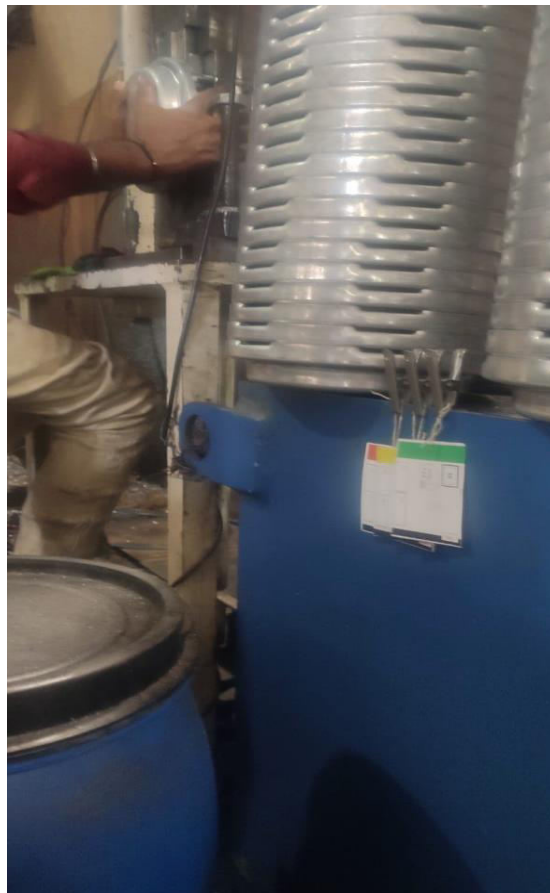
Fig- 8: Waiting materials for processing

Before implementation the inventory management was done visual inspection of stock which was inefficient and a cause for delay. Addition to that picking up the right material with right specification was complex and time-consuming unnecessary delay. Then the material has to flow in a way one after one but there is no control or monitoring in the flow which causes critical situation at various zones, unwanted confusion, jam of materials at various zones. To solve this issue Kanban approach is designed to help the manufacturer to have monitoring over processing goods, processed goods, and goods at raw material storage which prevents the waiting of materials. Kanban route cards will flow along the material in the shop line once they out from raw material storage. While stock out the raw material a similar card will hold a place on Kanban board which indicates the amount of goods are out for processing. Once the Kanban route cards are in flow it signals the operators of next process to clear out. At the end of the flow, after delivery the corresponding route cards will placed on Kanban board indicating delivered goods, which the supervisor can calculate amount of goods are currently in processing and can optimize the amount of goods can be processed at a time