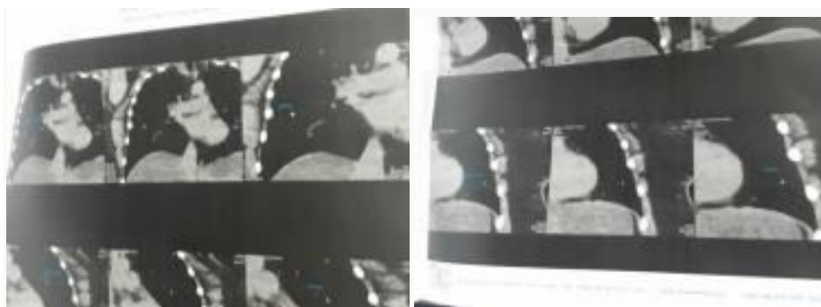
Figures 04, 05, 06 and 07. Computed tomography report and pulmonary nodules; the largest has 3.3 mm. Date of 2020/07/03