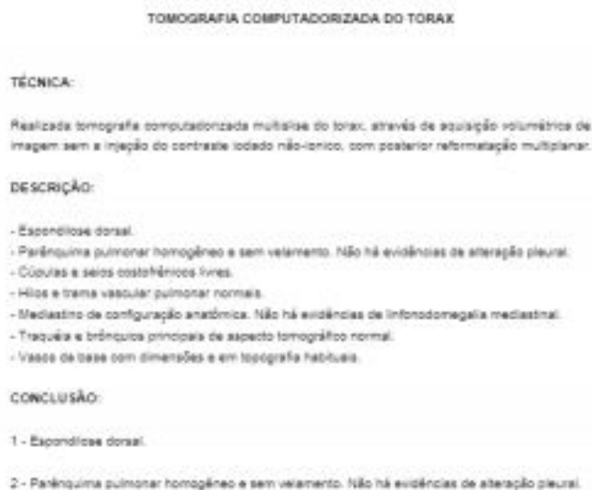
Figure 10. Chest computed tomography report. There were no pulmonary nodules. As of the writing date of this article, the author did not yet have all the images at hand.