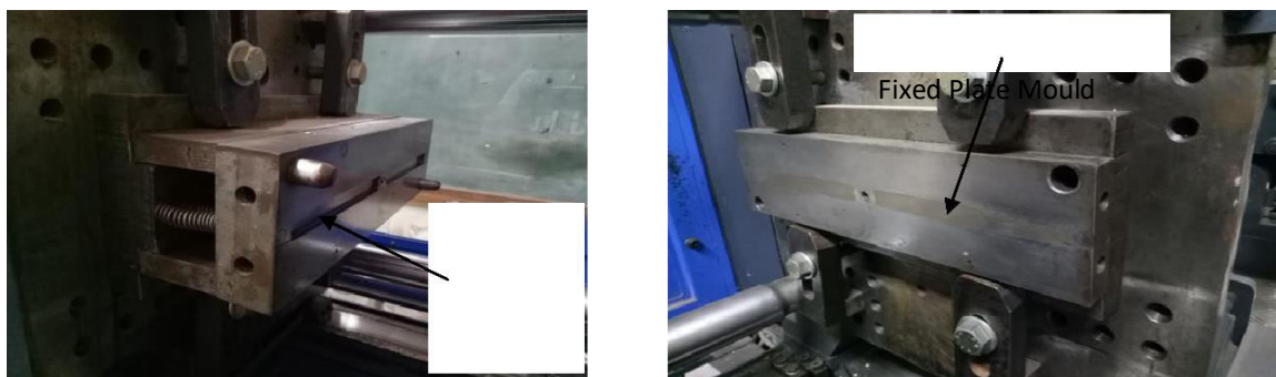
Fig. 1.5 The Mould Installed in the Machine

The mould consists of two mould plate one of them is stationary plate having flat surface and other is movable plate having mould.