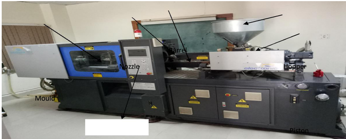
Fig. 1.4 Injection Moulding Machine