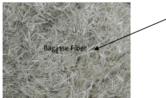
Fig 1.3 - Bagasse Fibers

From the bucket, fibers were collected and kept in direct sun light for 3days for drying.