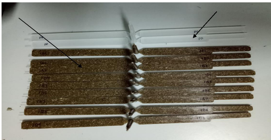
Fig -1.6.Specimen of Tensile, Flexural and Impact