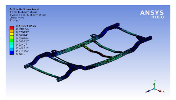
Fig. 4 Deformation in GF Chassis

As we have applied 14000N load on side members of the steel chassis, Maximum Equivalent stresses observed was 233.66MPa. The maximum stresses likely to be occurring at front boundary condition