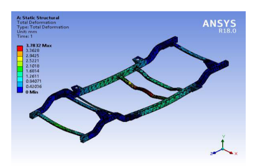
Fig 2. Deformation in Steel Chassis

As we have applied 14000N load on side members of the steel chassis, Maximum deformation observed was 3.7832 mm. The maximum deformation occurs at central cross member joint.