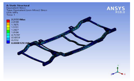
Fig 5. Von-Mises Stresses in Glass Fibre Chassis

As we have applied 14000N load on side members of the GLASS FIBRE chassis, Maximum deformation observed was 0.10221mm. The maximum deformation occurs at central cross member joint.