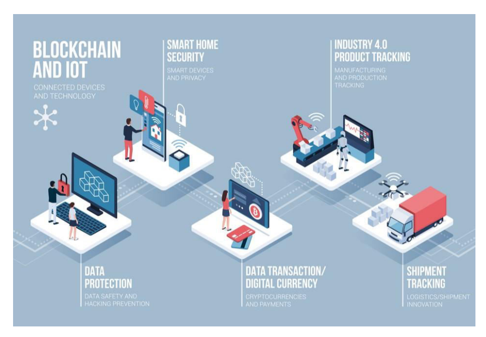
Figure 1. Blockchain and IoT

As the name Internet of Things, devices that are always connected to internet. So, if the devices lack security, they are vulnerable to virus and malware attacks and the control over the devices may be lost.