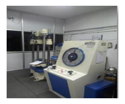
Figure 1 Tensile testing Process

Tensile testing, also known as tension testing,[1] is a fundamental materials science and engineering test in which a sample is subjected to a controlled tension until failure. Properties that are directly measured via a tensile test are ultimate tensile strength, breaking strength, maximum elongation and reduction in area.[2] From these measurements the following properties can also be determined: Young's modulus, Poisson's ratio, yield strength, and strain-hardening characteristics.[3] Uniaxial tensile testing is the most commonly used for obtaining the mechanical characteristics of isotropic materials. Some materials use biaxial tensile testing. The main difference between these testing machines being how load is applied on the materials.