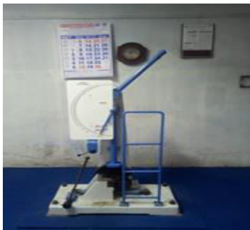
Figure 3 Impact Process

Impact testing of metals is performed to determine the impact resistance or toughness of materials by calculating the amount of energy absorbed during fracture. The impact test is performed at various temperatures to uncover any effects on impact energy.