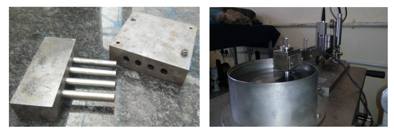
Figure 1 : Die and Punch

specimen, the green compacts are sintered in a vacuum furnace at a temperature of 550<sup>o</sup>C. The wear test was carried out for pure magnesium, Mg-5%SiC-5%Al<sub>2</sub>O<sub>3</sub>, and Mg-10%SiC-10%Al<sub>2</sub>O<sub>3</sub> composites using pin-on-disc apparatus as shown in Figure 2.