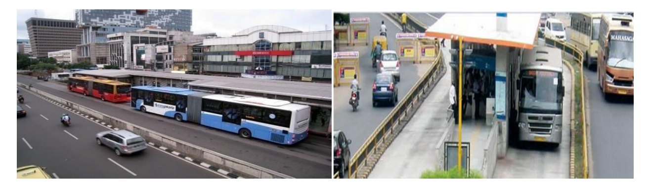
Fig .No.2: Bus Rapid Transit System

BRT systems is an innovative, high capacity, lower cost public transit solution. this System also increases efficiency and safety of public transportation systems and offer users greater access to information on system operations. BRTS motivating public to use public buses.