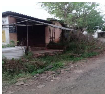
Fig No2 Shirgaon Village