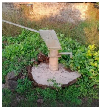
Fig No.3 Current Water Source