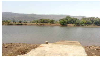
Fig No.3 Savitri River