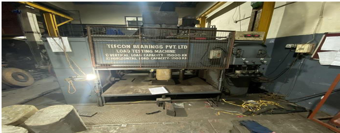
Fig 1 Application of load on Column