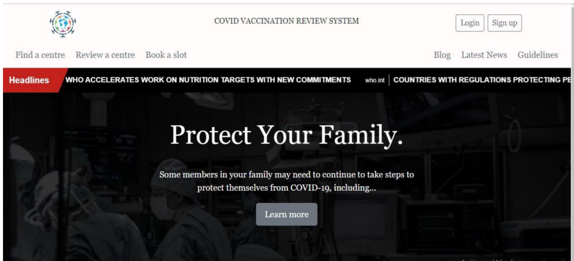
Fig 5. Homepage of the website