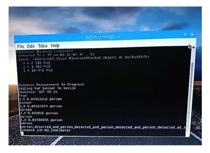
Figure No.3: OBJECT RECOGNITION