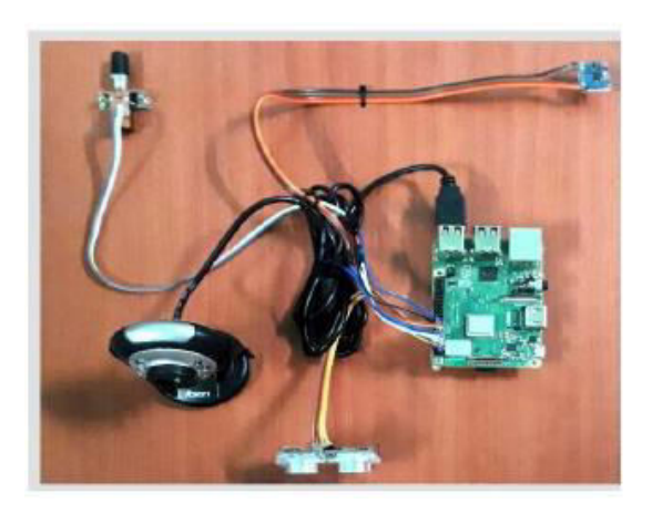
Figure No.2: Photo of the Proposed system

The proposed structure targets executing a perusing framework for visually impaired utilizing Python and Raspberry Pi. It does the going with limits, Image Capture, Convert to Text and Convert to voice. Measure the distance between the person and object. Fall detection sending notification to the caretaker's mobile number along with the location using GPS from GSM. This project acts like a virtual eye to blind people. It helps them in emergency.