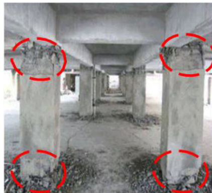
Fig 2.2 Plastic Hinge Formation at Column ends of the soft storey building

2) Figure 1.3 stand for the soft storey ground floor with soft storey ground floor at China Earthquake of a 6 storey developing because of the plastic hinge formation at the soil storey column which is likely to increase the inter storey drift at Ground Floor.