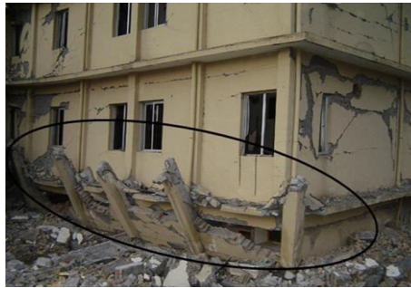
Fig 2.1 Failure of soft storey Building in Bhuj earthquake

1) The 2001 Bhuj earthquake (Magnitude M7.9 and PGA 0.11g) was among the most devastating a person to witness the collapse of several open ground storey RC buildings. A typical open ground storey residential building at Ahmadabad. The soil storey columns are badly harmed as found in Figure 2.1. Displays the failure of the very first storey columns as a result of shear in Earthquake.