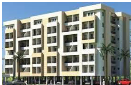
Fig 1.1 Open Ground storey Building

Open ground storey (also known as soft storey) buildings are commonly used in the urban environment nowadays since they provide parking area which is most required. This type of building shows comparatively a higher tendency to collapse during earthquake because of the soft storey effect. Large lateral displacements get induced at the first floor level of such buildings yielding large curvatures in the ground storey columns. The bending moments and shear forces in these columns are also magnified accordingly as compared to a bare frame building (without a soft storey). The energy developed during earthquake loading is dissipated by the vertical resisting elements of the ground storey resulting the occurrence of plastic deformations which transforms the ground storey into a mechanism, in which the collapse is Unavoidable. The construction of open ground storey is very dangerous if not designed suitably and with proper care. This paper is an attempt towards the study of the OGS buildings and its seismic analysis compared to manual and software calculations. A common Open Ground building are revealed is Figure 1.1.