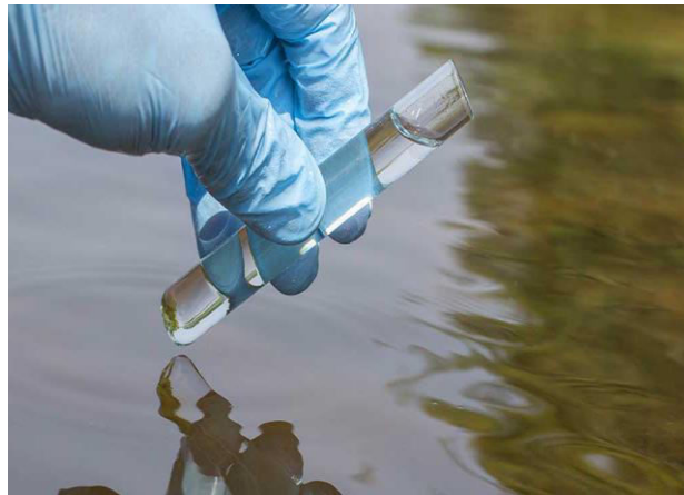
Fig no.1 Sampling

Proper sampling is a vital condition for correct measurement of water quality parameters. Even if advanced techniques and sophisticated tools are used, the parameters can give an incorrect image of the actual scenario due to improper sampling. The proper sampling should fulfill the following criteria: