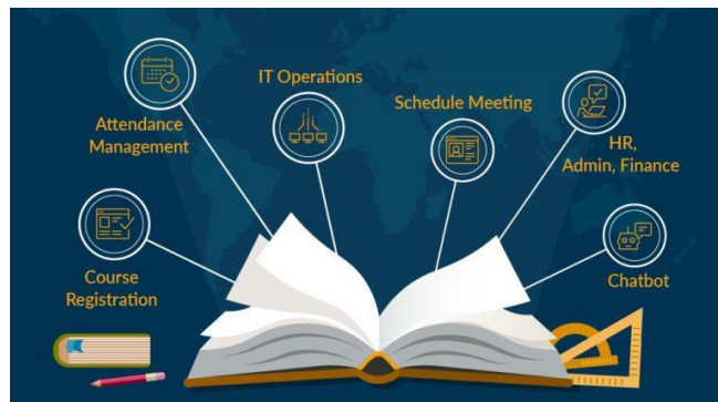
Robotic Process Automation in Education

In today's modern education system, technology is playing an important role in automating tasks, which are repetitive, time-consuming and rule-based. Eliminating the paperwork and manual work using automated education system. The software can used for admission, attendance, scheduling meeting, automated timetable generation, assignment mailing etc.