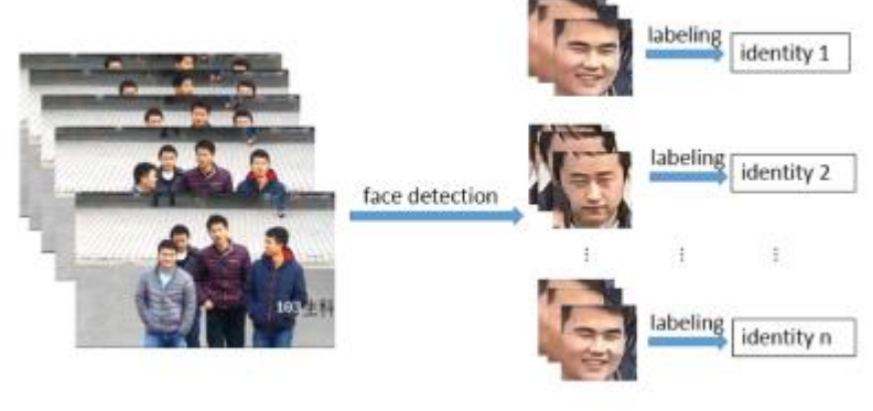
Figure1. Rough data set Generation