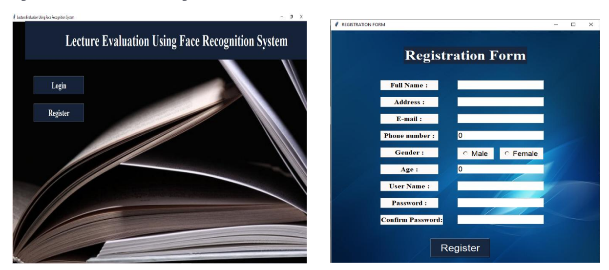
Fig-registration and login form

In this module, the Admin has to login by using registered user name and password. After login successful he can do some operations. This system ask user to fill lecture details and after that it can starting recognizing face expressions during lectures as shown in below figure.