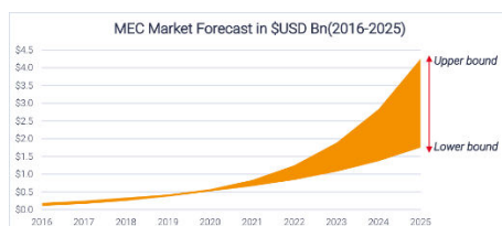
Figure 2. Analysts disagree on the forecasted size of the MEC market

MEC is viewed as to a greater extent a medium-term opportunity (2-3 years) for Telecom Company (telcos), as it will take effort for application designers to exploit the adequate framework which is yet to be conveyed – the world guide underneath shows that dominant part of telcos have just barely begun to turn out MEC locales. In terms of the actual market size for MEC, although there are some discrepancies (upper/lower bounds) on projections across multiple sources, the general trend is that the global MEC market will experience significant growth in the next few years. This growth will be primarily driven by telcos rolling out MEC infrastructure starting from 2020, as well as the deployment of MEC applications across various industries. Analysts disagree on the forecasted size of the MEC market is shown in figure 2.