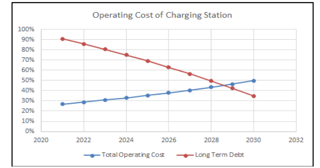
Fig.2.Operating Cost of Charging Station and Long-term Debt

Public sector partner inputs : Inputs that define the involvement of the public sector including whether the public sector will provide low interest debt, equity, a one-time grant, or ongoing financial support.