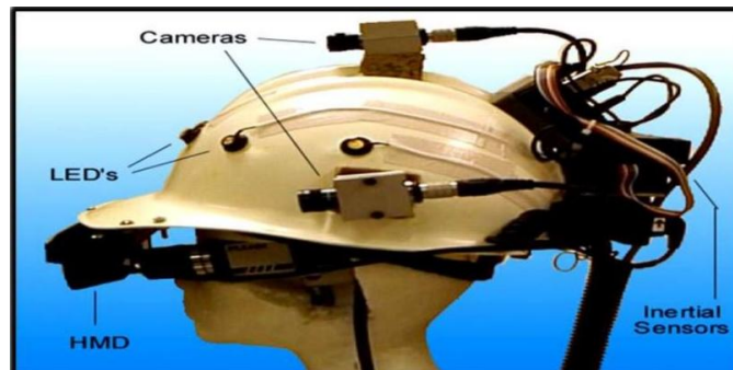
Head Mounted Display

Just like the monitors which allows us to see text and graphics generated by computer, head mounted displays (HMDs) will enable us to view graphics and text created by AR system.