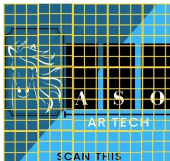
Fig 4: Inbuilt marker recognition By Vuforia engine Step1