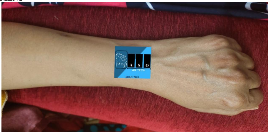
Fig 6: Placement of Marker