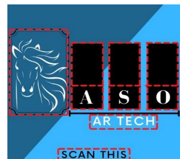
Fig 5: Marker recognition Step 2