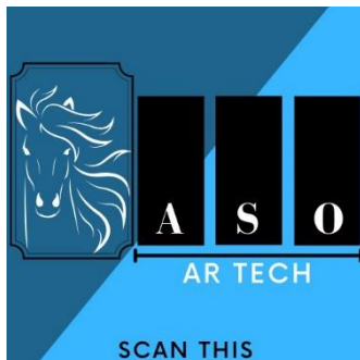
Fig 3: Marker for Scanning