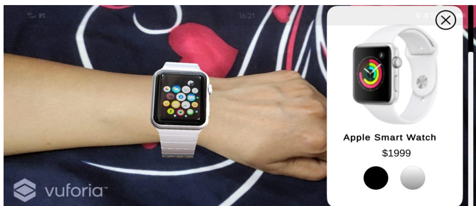
Fig 7: 3D Augmentation of products