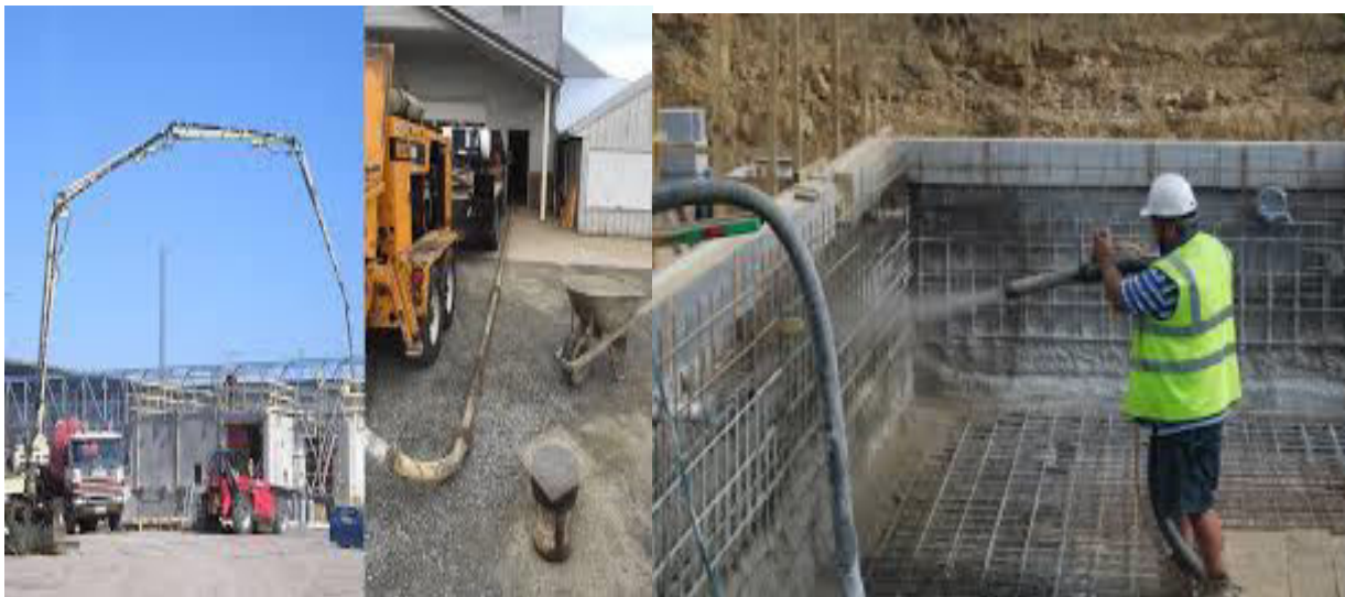
Fig: Concrete Pumping

For the productive siphoning of a strong through a pipeline it is major that the load in the pipeline is sent through the strong through the water in the mix and not through the aggregate, accordingly, this certifications the pipeline is lubed up. In case weight is associated through the all out all things considered, the complete particles will more modest together and against inside the line to shape a blockage; the force needed to move concrete under these conditions is two or three hundred times that needed for a lubed up mix. Expecting, in any case, weight is to be associated through the water, by then it is important that the water isn't blown through the solid constituents of the mix; experience exhibits that water is for the most part easily pushed through particles greater than around 600 microns in distance across and is fundamentally held by particles more diminutive than this. Also, the mix of cement, water and fine all out particles should not be blown through the voids in the coarse absolute. This can be cultivated by ensuring that the complete assessing doesn't have a whole nonappearance of material in two successive sifter sizes – for example, between 10 mm and 2.36 mm. Thus any size of atom should go probably as a channel to expect over the top advancement of the accompanying tinier size of material.