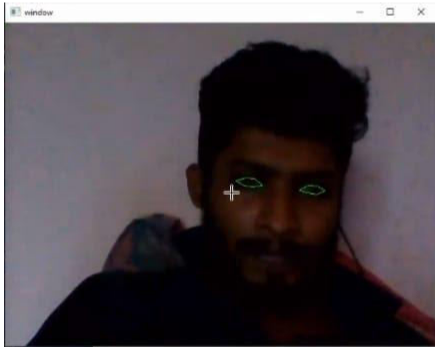
Figure3: Eye Detection

Eye Detection: This is first step. It apply facial landmark localization to extract the eye regions from the face.