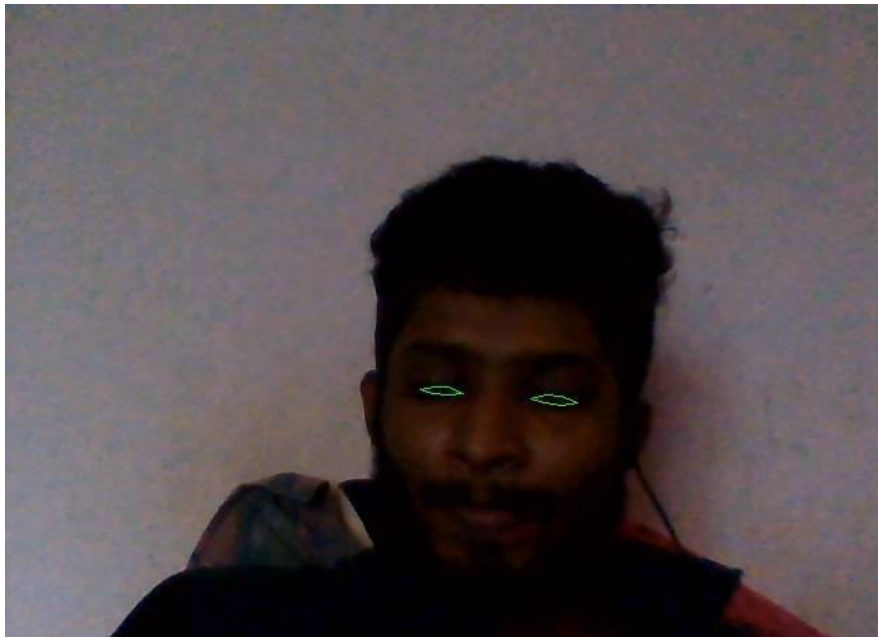
Figure5: Drowsiness Detection

Drowsiness Detection: It represents image analysis. It will alert the driver if the eyes have been closed for a sufficiently long enough time.