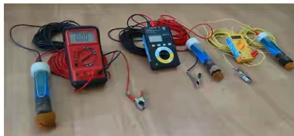
Fig. no. 5.6.1 Equipment for Half Cell Potential Method

The method of half-cell potential measurements normally involves measuring the potential of an embedded reinforcing bar relative to a reference half-cell placed on the concrete surface. The half-cell is usually a copper/copper sulphate or silver/silver chloride cell but other combinations are used. The concrete functions as an electrolyte and the risk of corrosion of the reinforcement in the immediate region of the test location may be related empirically to the measured potential difference. In some circumstances, useful measurements can be obtained between two half-cells on the concrete surface. ASTM C876 - 91 gives a Standard Test Method for Half-Cell Potentials of Uncoated Reinforcing Steel in Concrete.