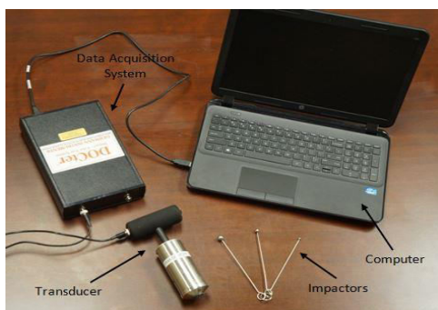
Fig:Equipment for Impact Echo Test