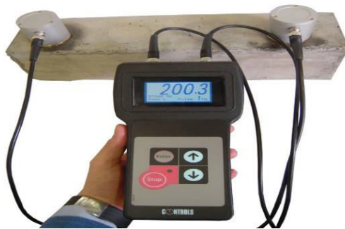
Fig:Ultrasonic Testing Equipment