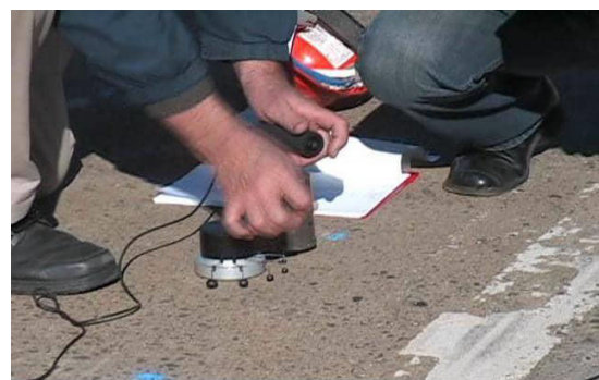
Fig:Testing of Concrete Member