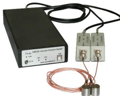
Fig:Acoustic Emission Instrument

Acoustic Emission (AE) is a non-invasive, non-destructive method that analyses the noises created when materials deform or fracture. Each acoustic emission event is a signature of an actual mechanism, a discrete event that reflects a given material response there is a critical difference between acoustic emission and ultrasonic methods. In the former, a known signal is imparted into a material and the material's response to on the signal is studied while in the latter the signal is generated by the material itself. These waves are originated by micro crack formation or propagation in concrete.