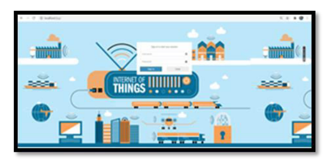
Fig 1: Login

Figures show the results of Gas Leakage Detection System and Alert System. Which includes the temperature majored by system. And all other output are described in following fig. On the web page. The system shows the important index values and result of analysing the sensor values. In web page real time gas percentage, heat, humidity, smoke, presence and temperature .Temperature values are display on dashboard. For the gas detect unacceptable values of any sensor then directly send alert message to the user and user also can enquire about the status of all sensor values.