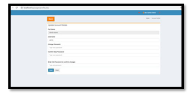
Fig 3: Profile