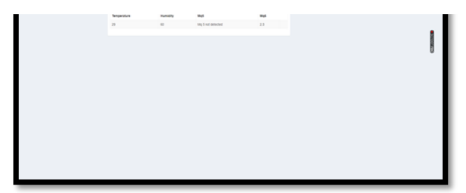
Fig 2: Sensor Data