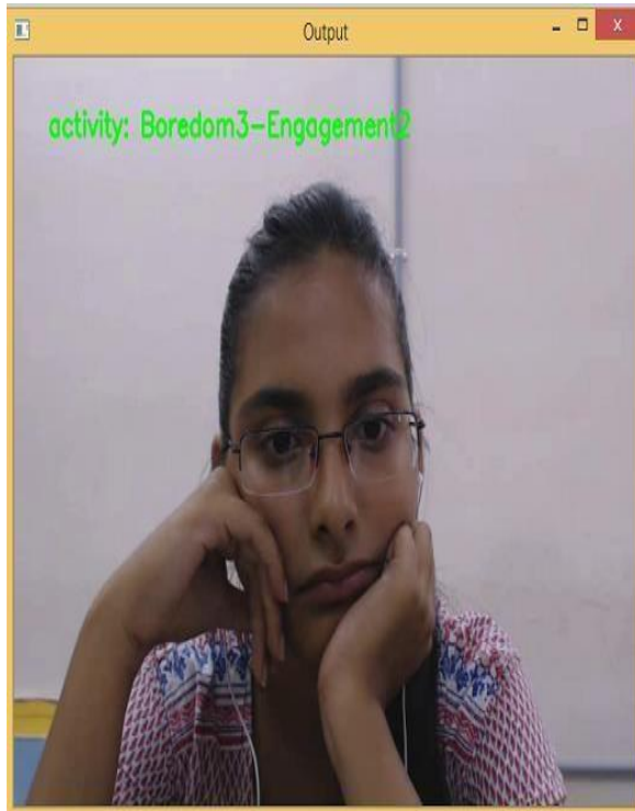
Fig 5: The above student is in the 3 rd level of the boredom state and 2 nd level of engagement state i.e., she is bored while listening the lecture.