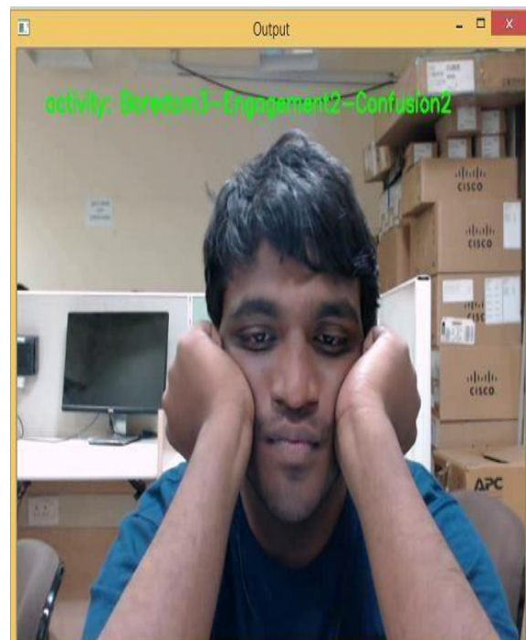
Fig 4: The above student is in the3 rd level of the boredom state,2 nd level of engagement state and also 2 nd level of confusion state i.e., he is bored and a little confused towards the lecture he is listening.