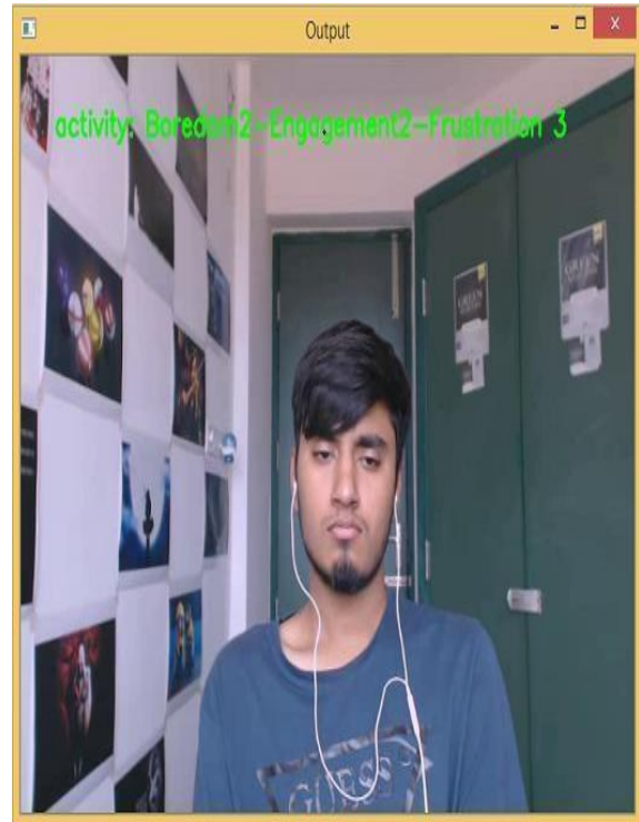
Fig 6: The above student is in the 2 nd level of the boredom state, 2 nd level of engagement state and also 3 rd level of frustration state i.e., he is bored and a little confused towards the lecture he is listening.