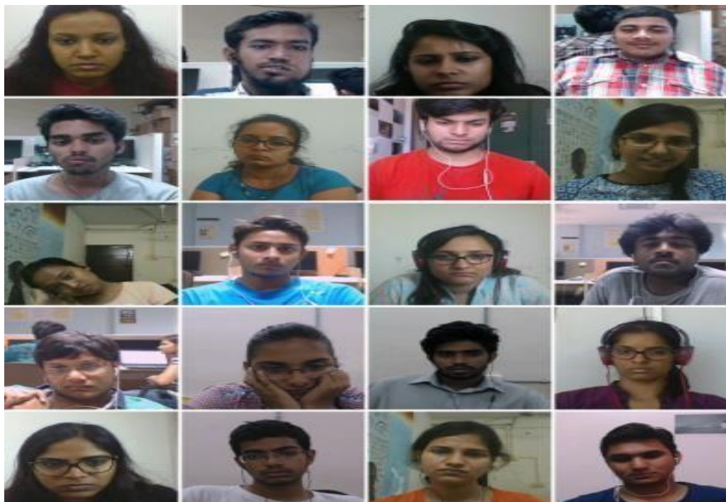
Fig.2: Sample Input