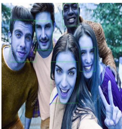
Fig2: Output Image