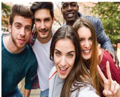
Fig 1: .Input image