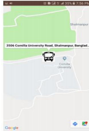
Fig. 9. Bus Location on Map

when the software is released, home hobby indicates the person module. whilst a person selects this module, every other hobby might be opened in which the consumer will choose the bus wide variety and input the login credential proven in figure eight. Then, the map can be displayed to be able to show the modern place of the bus as shown in figure 9.