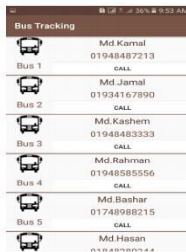
Fig. 7. Drivers' Details

To search for a bus vicinity a consumer has to go into the bus variety and login credentials. Then, the map can be displayed so as to show the modern-day region of the bus. they can get access to the info of all the buses through their cellular telephones. here, they'll also get the bus and motive force-related information as proven in discern 7.