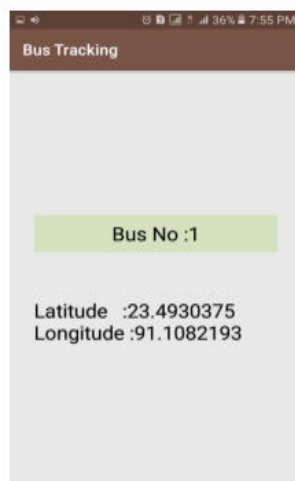
Fig. 6. Bus Location