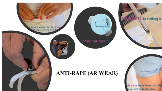
Fig. 4 Anti-rape (AR Wear)